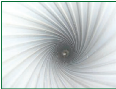
Barrel cleaned after using Vapro VBCI 270